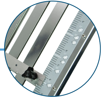
Clearly Marked Fold Plates Fold plates are pre-marked with four common fold settings