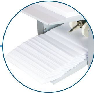
Output Conveyor & Stacker Wheels Stacker wheels can be adjusted for neat and sequential stacking