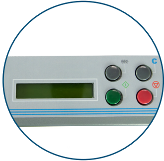
LCD Control Panel Features a 3-digit resettable counter with AutoBatch

The FD 314 Office Desktop Folder provides clearly-marked fold settings and push-button operation make it easy to use, right out of the box. It's capable of folding 11" and 14" paper at speeds up to 7,700 sheets per hour , with a hopper capacity of up to 250 sheets . Fold plates are pre-marked with four common fold settings letter, zig-zag, half and double parallel and can be easily adjusted for custom folds. The LCD control panel includes a resettable 3-digit counter , and AutoBatch for processing a set number of sheets with a pause between sets. The built-in output conveyor features easily adjustable stacker wheels for neat, sequential stacking of folded pieces.